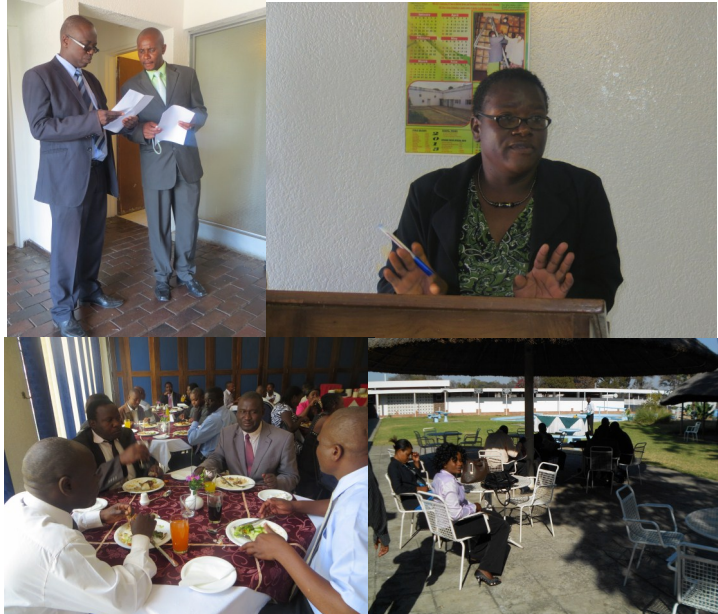
Gweru Records Centre Silver Jubilee celebrations in pictures